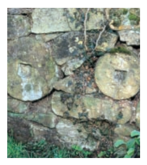
In some places the core of old stone pipes, saddle stones and other reused stone artifacts can be seen in walls.

Features in the dry stone walls in the Cotswolds contribute to the diversity of the area, and reflect local history. Walls contain many unusual features, including holes for livestock to pass through, stone steps, water troughs, stone styles, archways and bee boles – a shelter within the wall where beehives used to be kept.