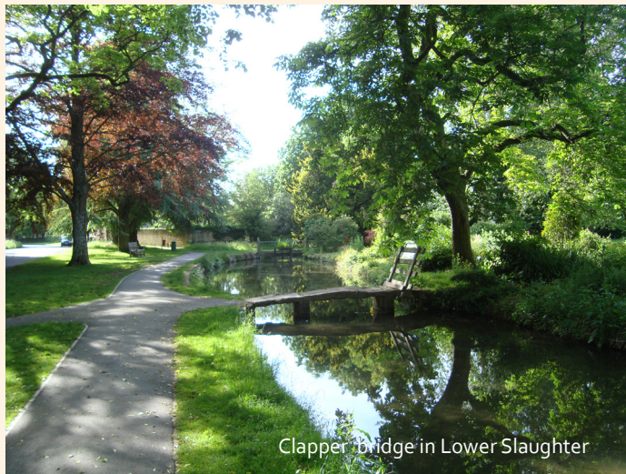
Clapper bridge in Lower Slaughter

At the road turn left and in 150m arrive at the war memorial.