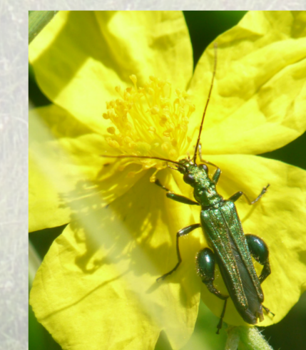
Thick Shinned Beetle/ Rock Rose