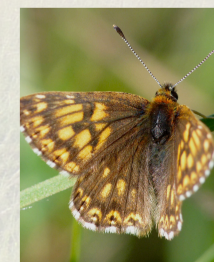
Duke of Burgundy