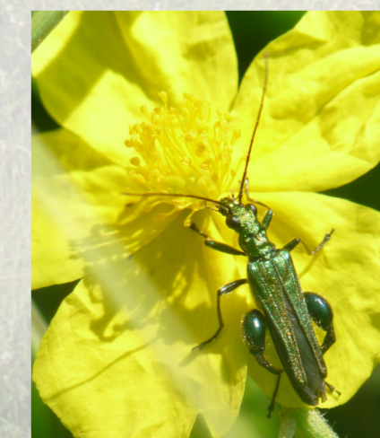
Thick Shinned Beetle/ Rock Rose