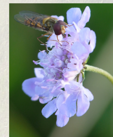
Hoverfly on Scabious