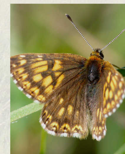
Duke of Burgundy