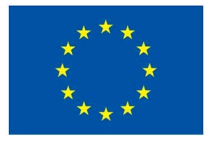
The European Agricultural Fund for Rural Development: Europe investing in rural areas

It is part funded by the European Agricultural Fund for Rural Development