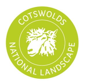
Cotswolds National Landscape