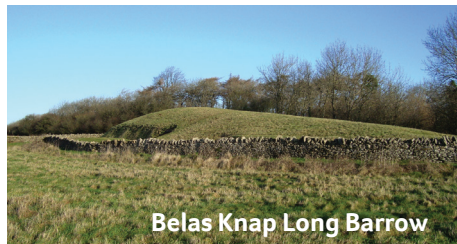
Belas Knap Long Barrow

Looking forward, you will see the smooth form of Belas Knap, an ancient long barrow.