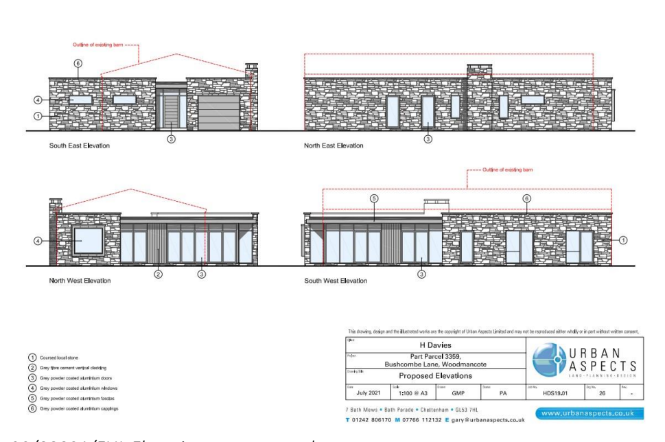
22/00031/FUL Elevations as proposed

The Board therefore recommends that the LPA requests that the applicant reviews the layout and elevations of the proposal, reduce the expanse of the glazed elements and provides a further assessment on this matter to address this concern before the application is determined.