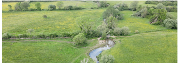
Part of the meadows forming Greystones Farm Nature Reserve