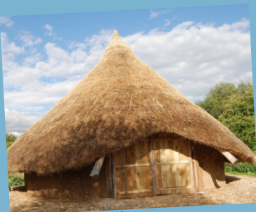
Iron Age Roundhouse

The reserve is managed by Gloucestershire Wildlife Trust. Here, you can visit the Discovery Barn at the farm buildings which has displays about the history and wildlife on the site. Check opening hours.