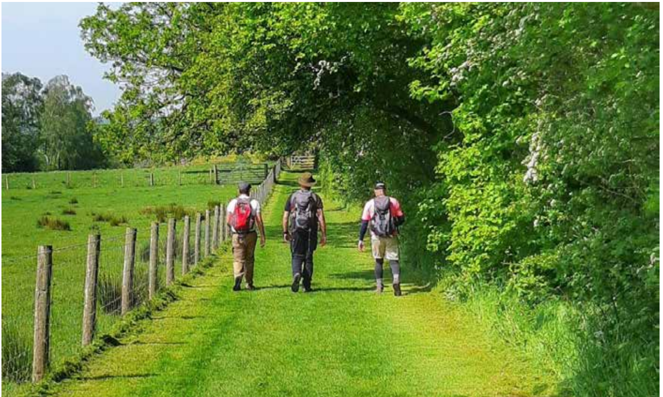
Photo 17 - Grassland management regimes on Hadrian's Wall Path.

“We couldn’t have chosen a better long distance path! The weather has been phenomenal and scenery stunning. I’ve also recorded some rare orchids and butterflies along the way - most notably the duke of burgundy on Prestbury Hill and chalkhill blue. Scarce birds included red kite, redstarts and crossbill. Waymarking was spot on and needed little help from OS maps so that was most appreciated.” 9