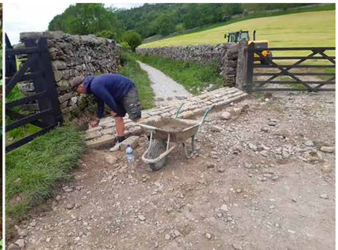
Photo 4 - One of 2 new stone cross drains to deflect water away from the Pennine Bridleway.