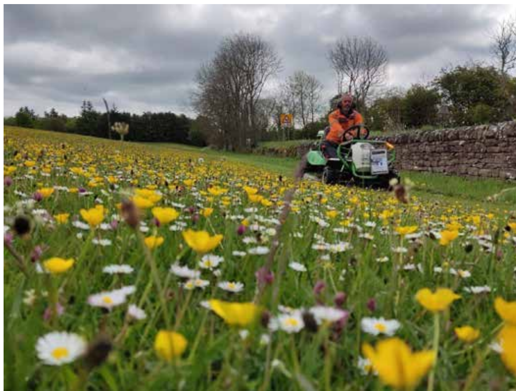
Photo 1 - Grassland management regimes on Hadrian's Wall Path.