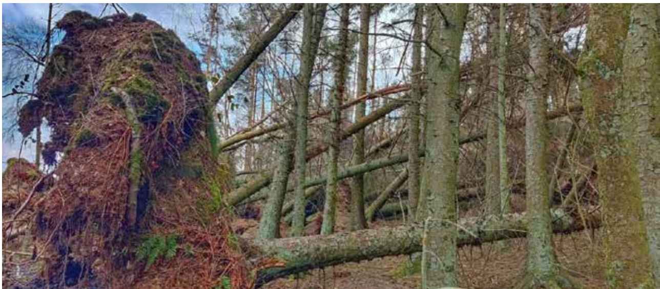
Photo 7 - Storm Arwen devastation and diversions on Hadrian's Wall Path.