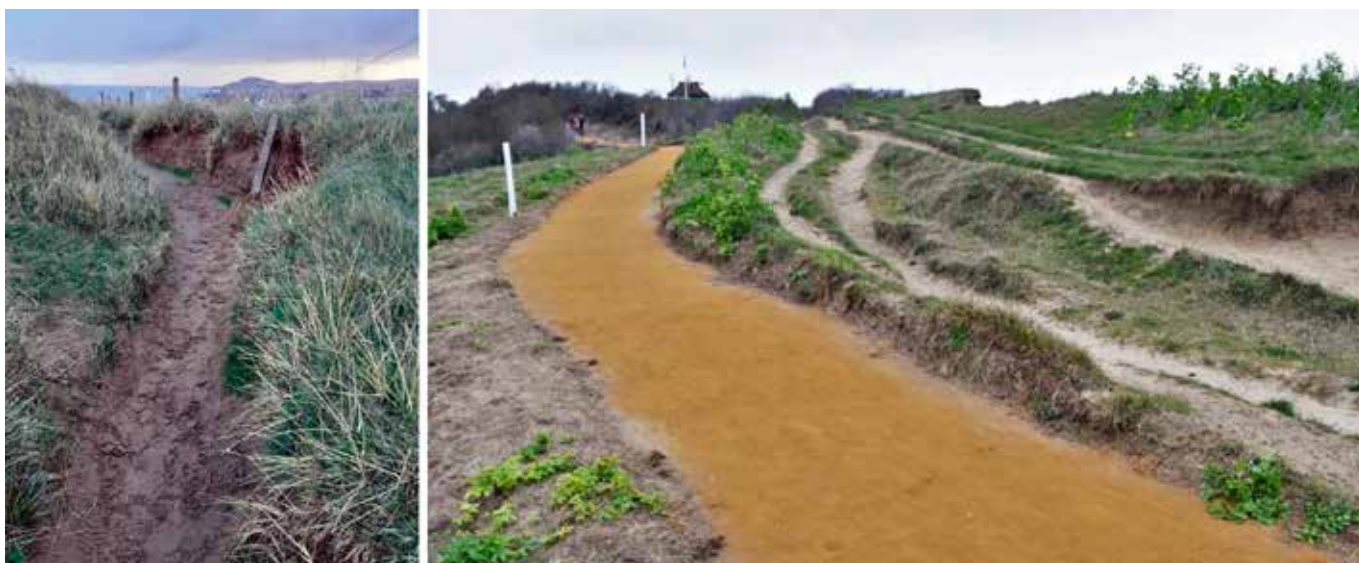
Photo 8 & 9 - Before and after photos taken at Skelding Hill on the Peddars Way and Norfolk Coast Path.

The trails continued to work to improve access for all. In addition to the majority of open sections of the England Coast Path , the trails with no stiles are the Cleveland Way , Pennine Bridleway , Thames Path , The Ridgeway and Yorkshire Wolds Way . Only one stile remains on the Peddars Way and Norfolk Coast Path .