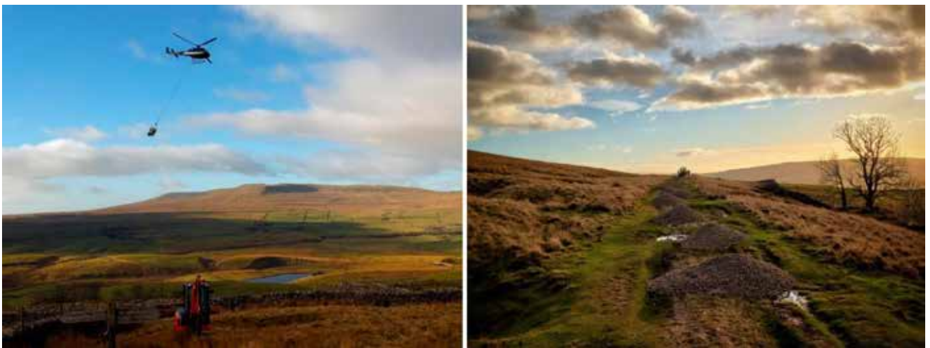
Photo 5 & 6 - Re-surfacing works on Harberscar Lane on the Pennine Way in the Yorkshire Dales.