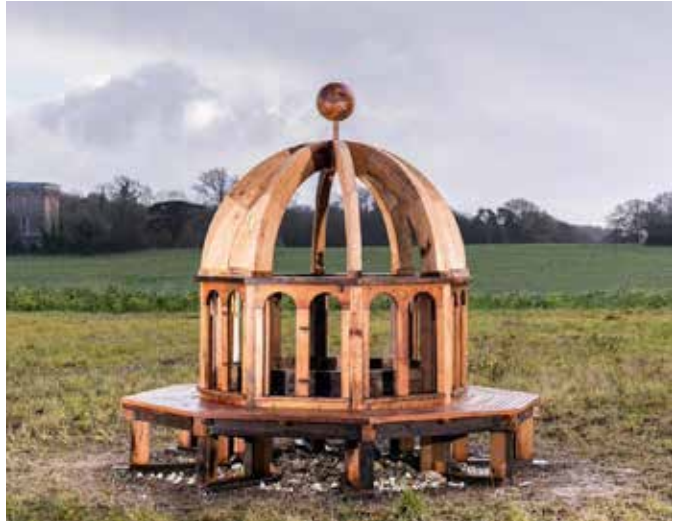
Photo 2 - Monumenta Romana, part of the Via Francigena Arts Trail on the North Downs Way.