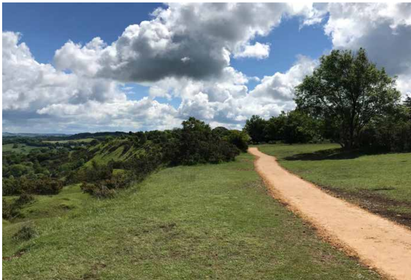
Photo 20 - Surfacing at Leckhampton Hill on the Cotswold Way to allow greater access for mobility scooters.

The England Coast Path continues towards completion with three stretches (see section 2) either fully or partially commencing during this period. This was in spite of the delays to establishment works on the ground arising from the impact of the Covid 9 pandemic. The government announced in February 2022 that the England Coast Path will be fully walkable by the end of this Parliament – connecting communities from Northumberland to Cornwall.