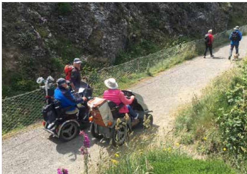
Photo 11 - Easy Access Awareness Day for Path reps at Penrose estate in Cornwall on the South West Coast Path.