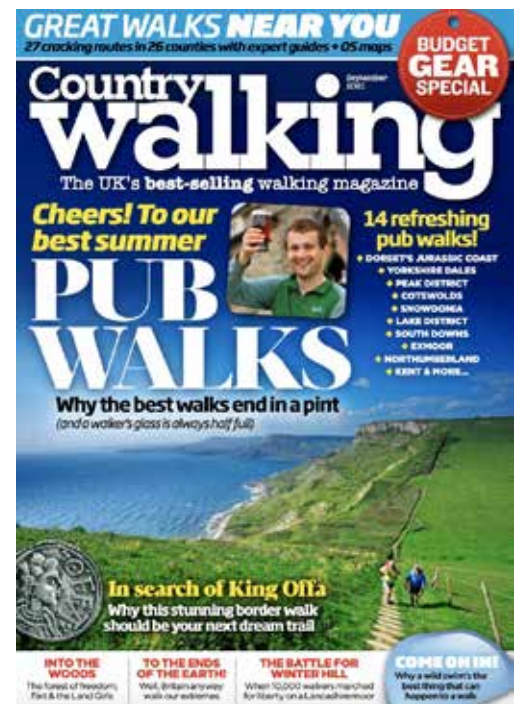
Photo 19 - Cover of the September 2021 edition of Country Walking magazine featuring Offa's Dyke Path.