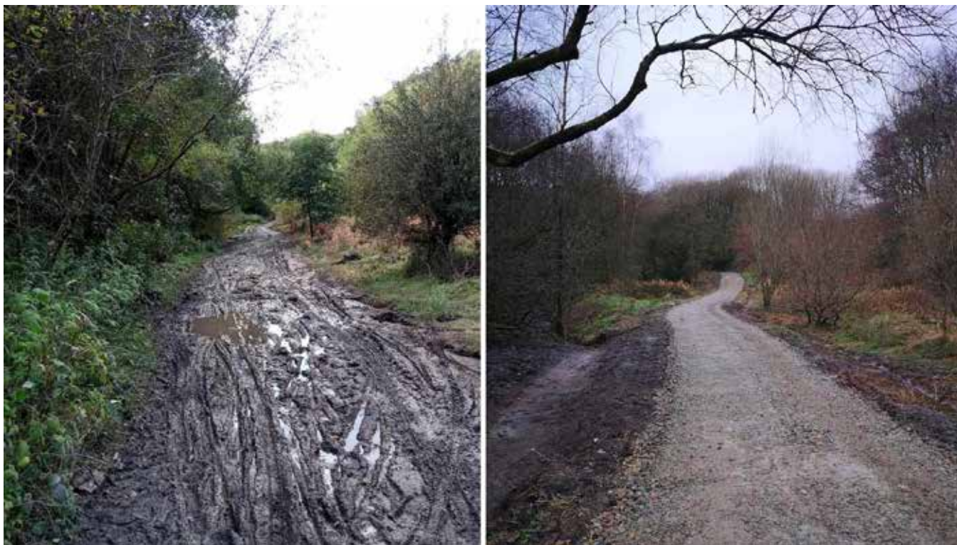
Photo 13 & 14 - Pennine Bridleway at Wallbank before and after accessibility improvements.