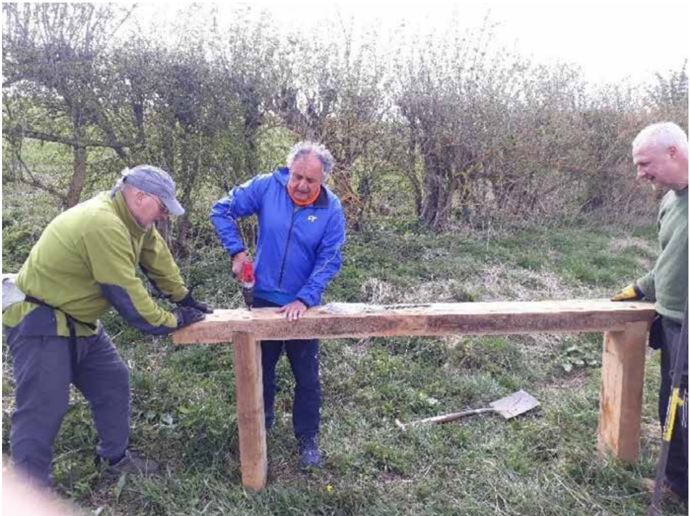
Photo 16 - Beverley Ramblers fitting a new bench at Bottom Plantation on the Yorkshire Wolds Way.