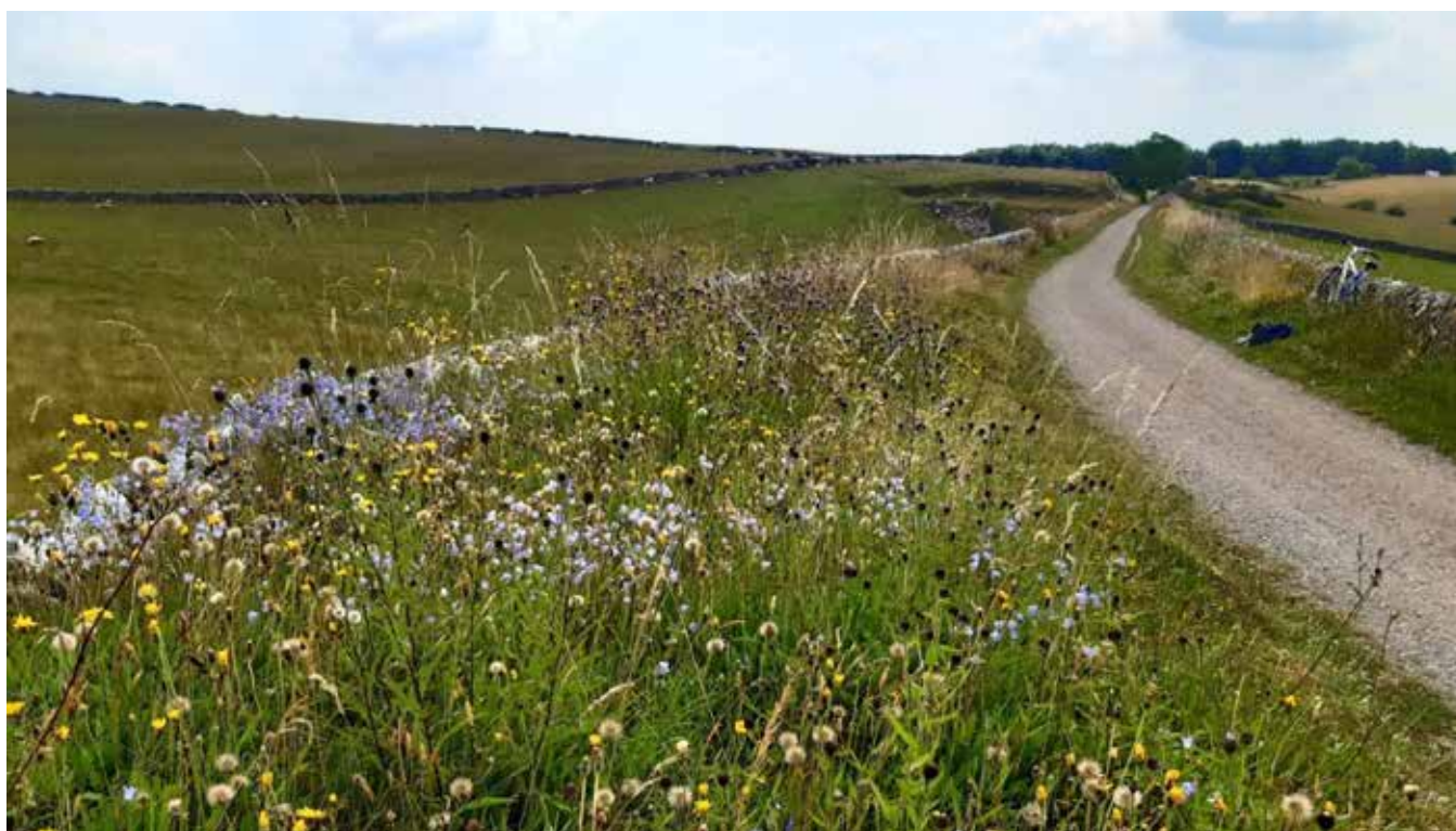
Photo 18 - Wildflowers along the High Peak Trail section of the Pennine Bridleway.