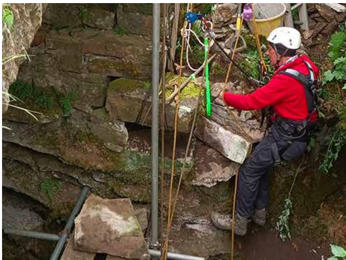
Photo 3 - Works underway on Hell Gill Bridge on the Pennine Bridleway.