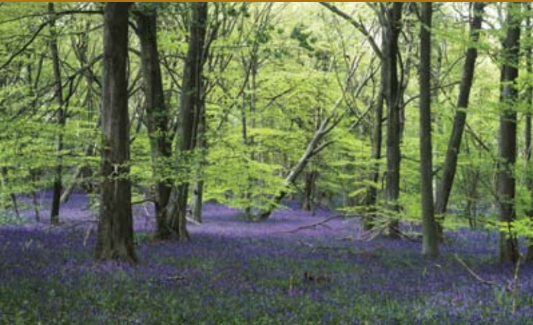
Foxholes Nature Reserve