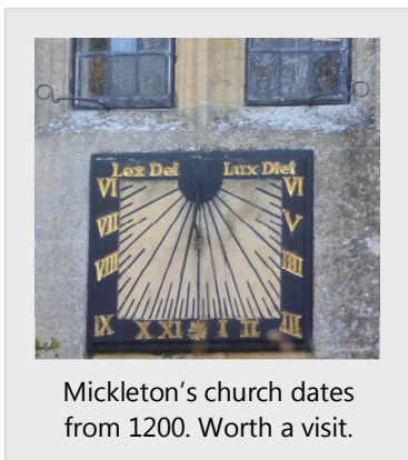
Mickleton's church dates from 1200. Worth a visit.