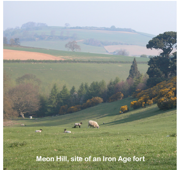
Meon Hill, site of an Iron Age fort

You'll walk past this beech avenue that was planted by Lawrence Johnston after he bought the estate in 1907. He planned the garden as a suite of rooms, each one leading to another of a different colour and style. It is now a popular National Trust property.