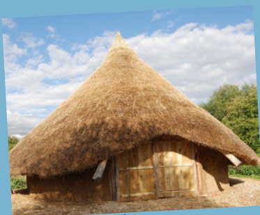
Iron Age Roundhouse

The reserve is managed by Gloucestershire Wildlife Trust. Here, you can visit the Discovery Barn at the farm buildings which has displays about the history and wildlife on the site. Check opening hours.