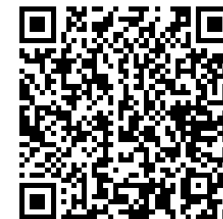
Jane Austen's world – Beechen Cliff.

In addition to the Circuit of Bath the scheme promotes a range of shorter local walks, runs the annual Bathscape Walking Festival each September and a series of weekly walks throughout the year.