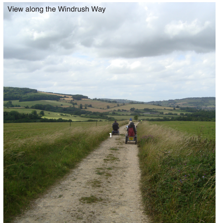
View along the Windrush Way

Food Fanatics Delicatessen and the Corner Cupboard in Winchcombe. Disabled public toilets in Back Lane car park Winchcombe.