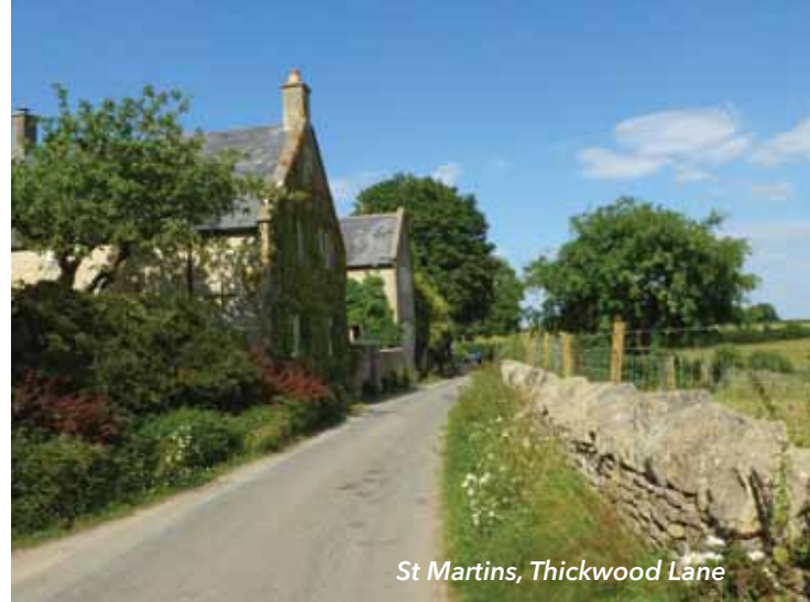
St Martins, Thickwood Lane

Passing St Martins House on the left take the right-hand fork to leave Thickwood and crossover the stile on the left into a field. Exit the field cross over the road towards Hall Farm.