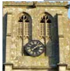
One handed clock, dating back to 1685