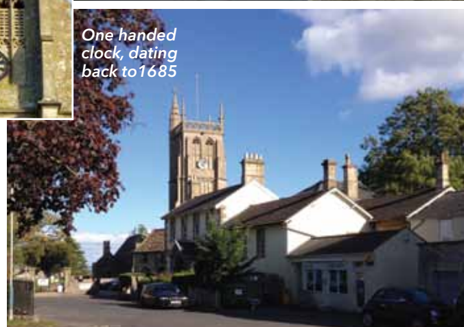
Colerne Market Place