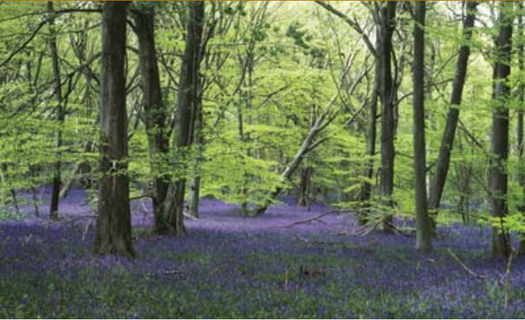
Foxholes Nature Reserve